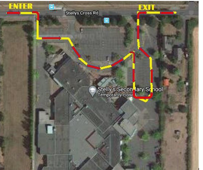
Map #2 - Public Procession Route